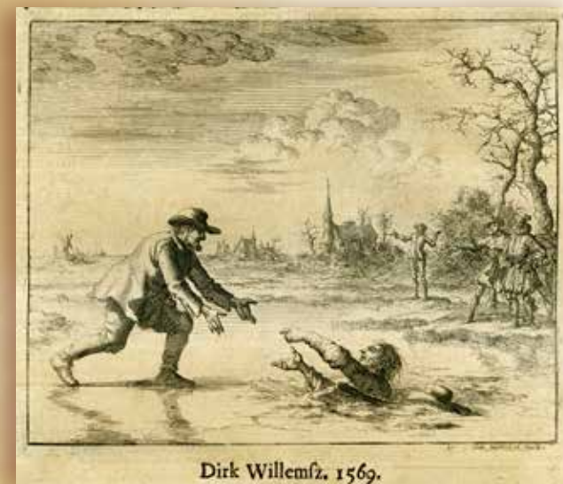
Faithfulness in action: this man turned back to rescue a cruel enemy from drowning, but was then condemned to death and slain, in spite of his unusual act of mercy.

I can forgive others. I can accept hard trials, and still trust my heavenly Father.